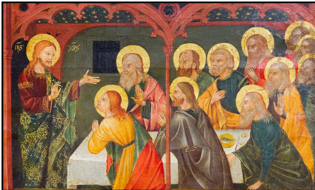
Commentary from The Liturgical Year by Dom Prosper Guéranger O.S.B. (1805-1875).

He also lays great stress on our being attentive to the truths we have been taught, and on our guarding against that culpable forgetfulness, which plays such havoc with thoughtless souls. Many of those who have received the grace of the Easter mystery this year will not persevere; and the reason is that they will allow the world to take up all their time and thoughts, whereas they should use the world as though they did not use it (cf. I Cor. 7:31). Let us never forget that we must now walk in newness of life, in imitation of our risen Jesus, who dieth now no more.